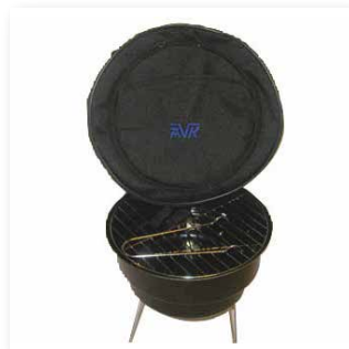
Picnic grill in a cooler bag