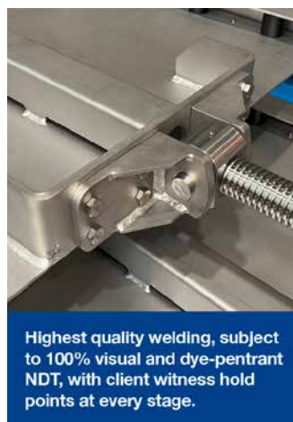
Highest quality welding, subject to 100% visual and dye-penetrant NDT, with client witness hold points at every stage.