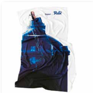
Beach towel with AVK valve