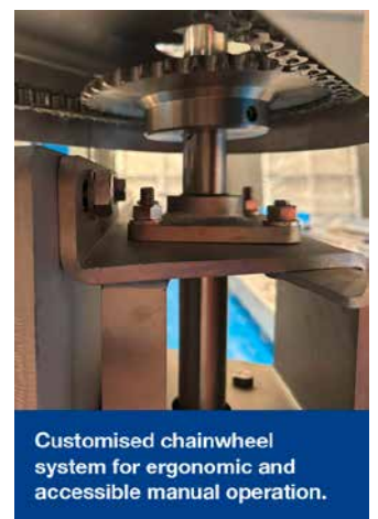
Customised chainwheel system for ergonomic and accessible manual operation.