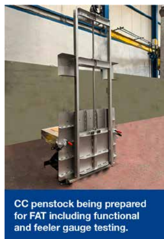
CC penstock being prepared for FAT including functional and feeler gauge testing.