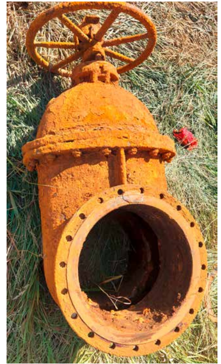
An AVK PREMIUM100 gate valve installed in the system, and one of the old, now replaced valves.