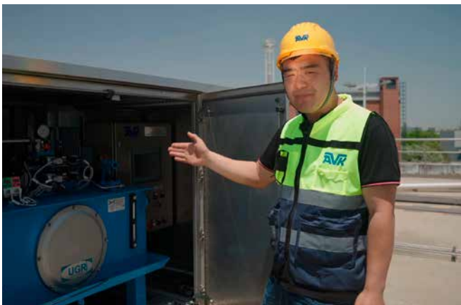
One of the weir penstock hydraulic control units finalised.

We understand that customers expect not just high-quality products but complete solutions and comprehensive service and support. Therefore, the AVK Shanghai team is personally involved in the entire process of specification development and implementation, helping to improve and optimize the existing valve system and design new urban water infrastructure. Through close collaboration with customers, AVK creates value at every step, demonstrating its professionalism and responsibility as a partner in the field of urban water services.